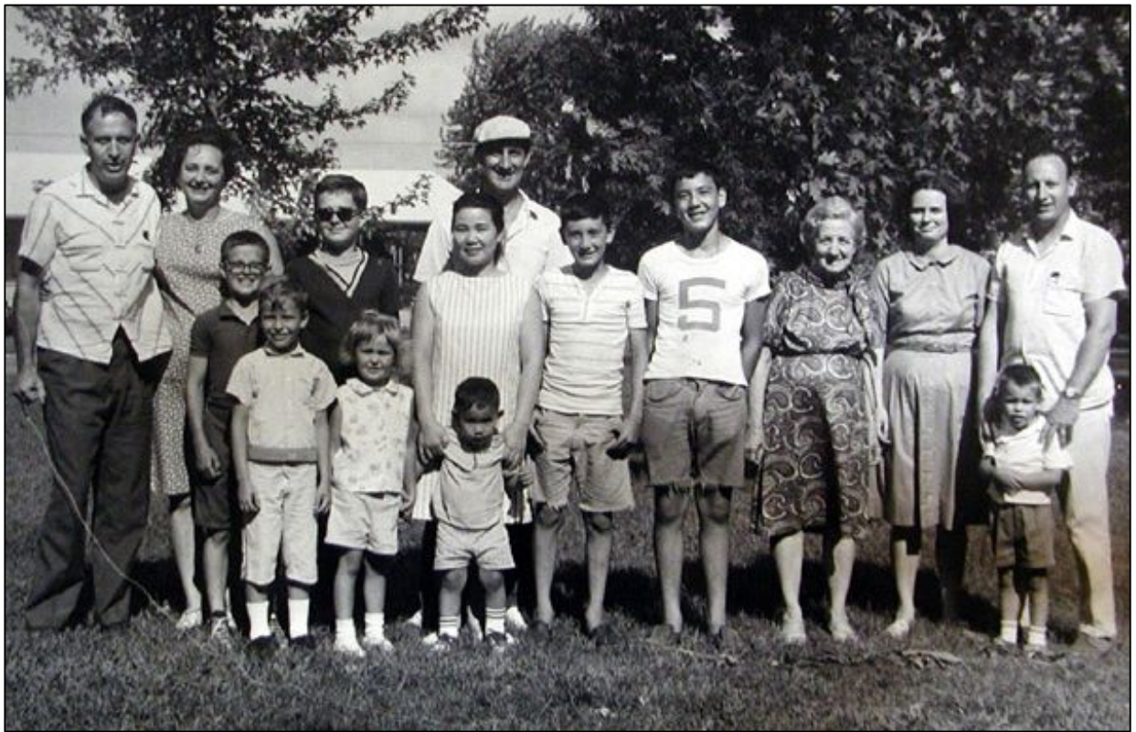
Winfree Family Reunion, Winfree Homeplace, Baxter, Tennessee