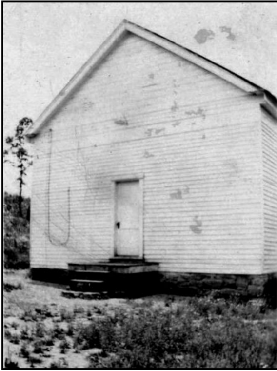
Denny's Seminary One room schoolhouse built ca. 1872.