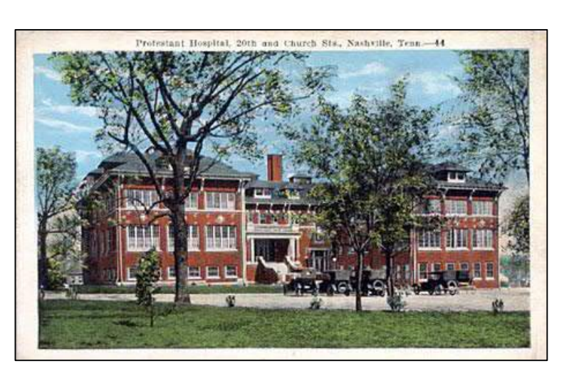
Protestant Hospital, 20<sup>th</sup> & Church Street, Nashville, Davidson Co., TN, now called Mid-State Baptist Hospital