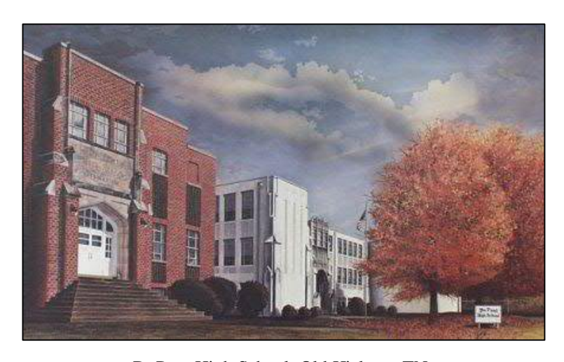
DuPont High School, Old Hickory, TN