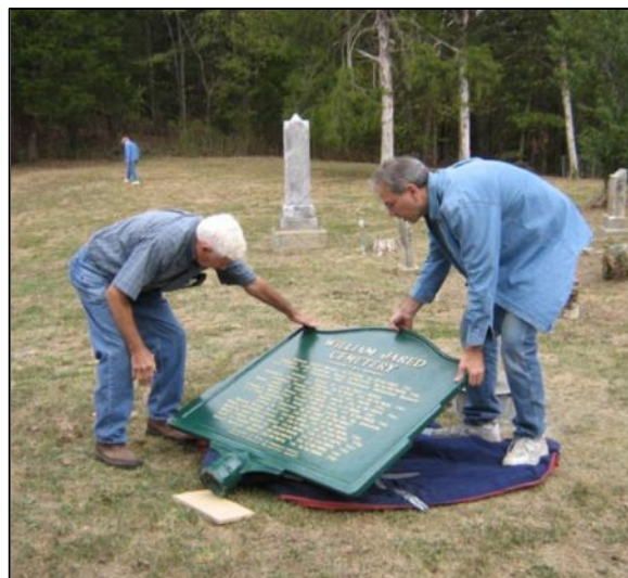
The sign was the Revised Ohio design (double sided) Light Green - Gold Leaf letters DAR insignia on the Rev'l War soldier's side Size ht: 33" Size Wdth: 43" Ltr. Size: 5/8 and 2" on the Rev'l War Soldiers side.