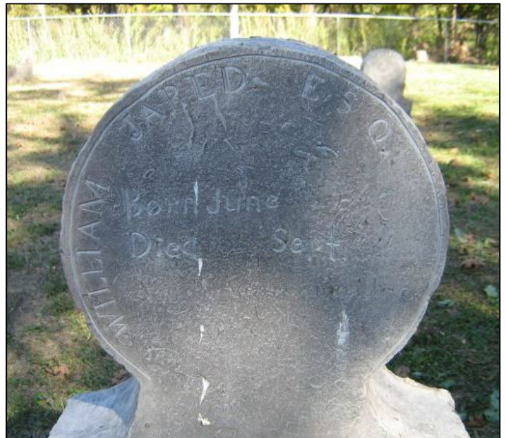
WILLIAM JARED TOMBSTONE BEFORE AND AFTER RENOVATIONS.