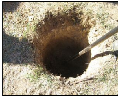
The hole had to be 10"-12" in diameter and 36" deep. Then 440 lb. of cement was added to the hole after the 7' aluminum post was plumbed and braced. We let the cement set for a day and the next day added the sign to the post.