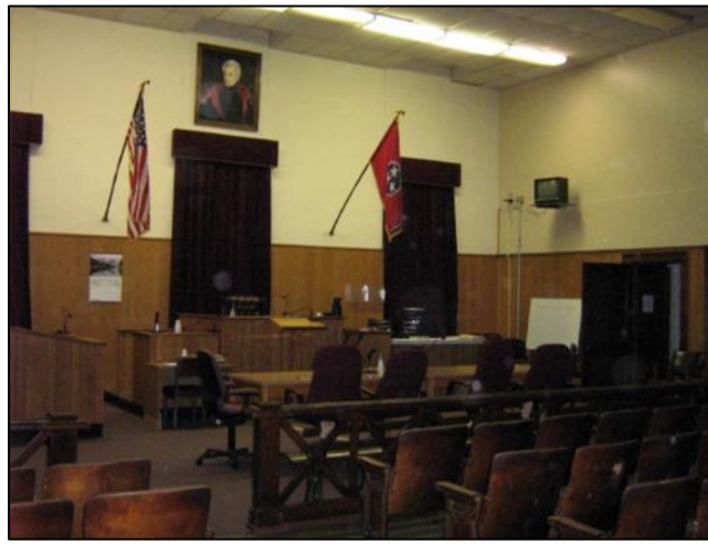
Inside the Jackson County Courthouse, Gainesboro, Jackson Co., TN. This is a photo of the Jackson County Courtroom.