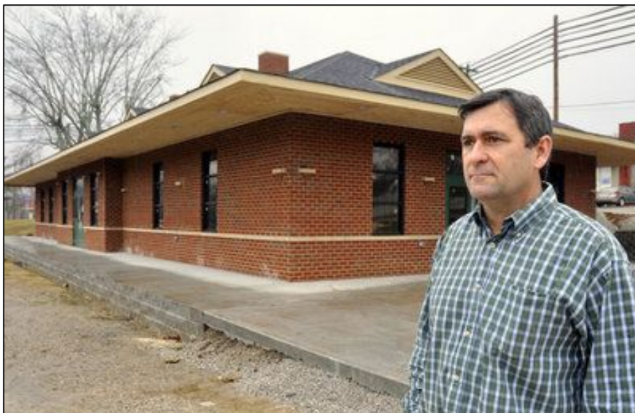
THE NEW BAXTER DEPOT

Herald-Citizen, Cookeville, TN: 4 February 2011.