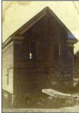
The old Mill in Buffalo Valley where corn was grounded in the 1800's.