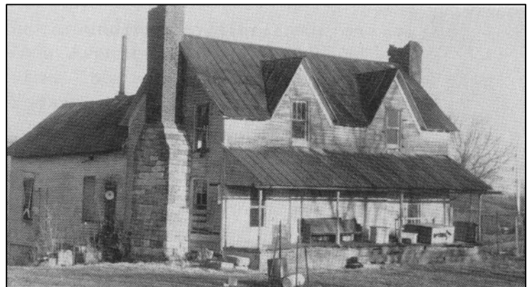
Luke Leftwich old residence, located near Gentry and Big Indian Creek. was built about 1850.