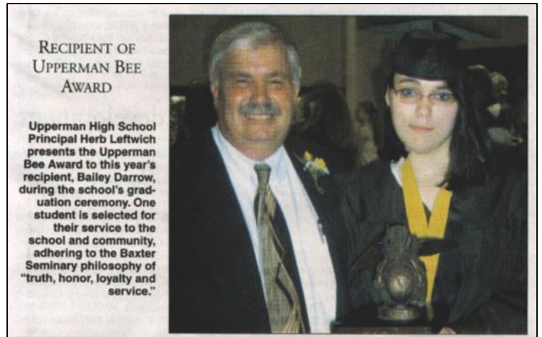
Herald Citizen Newspaper, Cookeville, TN - Schools, Section B, Thursday, 1 June 2006.