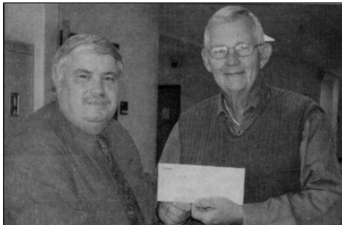
DONATION TO UHS