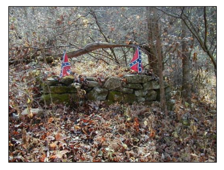
Confederate Soldiers Grave

Listed in Smith County Cemeteries - South of the Cumberland River Pg.186.