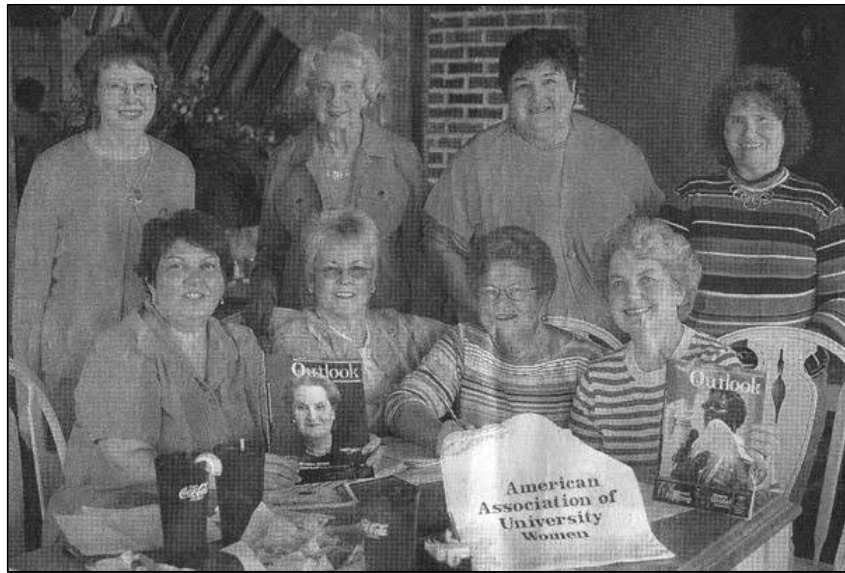
Cookeville AAUW Hosting State Convention Herald Citizen Newspaper, Cookeville, TN 20 April 2005