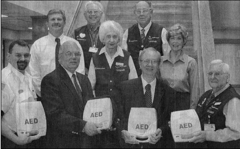
Herald-Citizen, Cookeville, TN Sunday, April 3, 2005 Page 3.