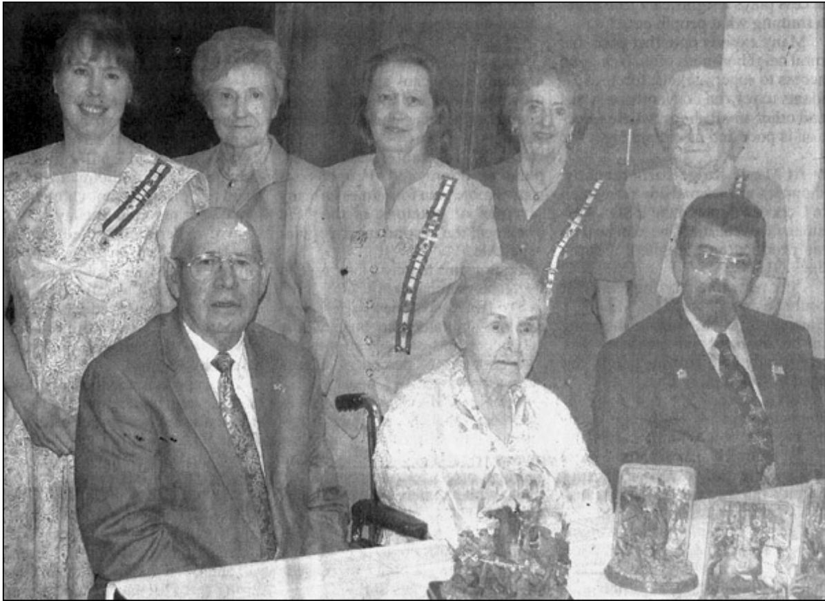
Honoring History Herald Citizen Newspaper, Monday, 2 August 2004: Living