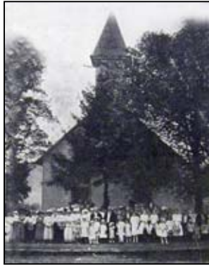
Church of Christ Leiper's Fork , Franklin, TN 1916.