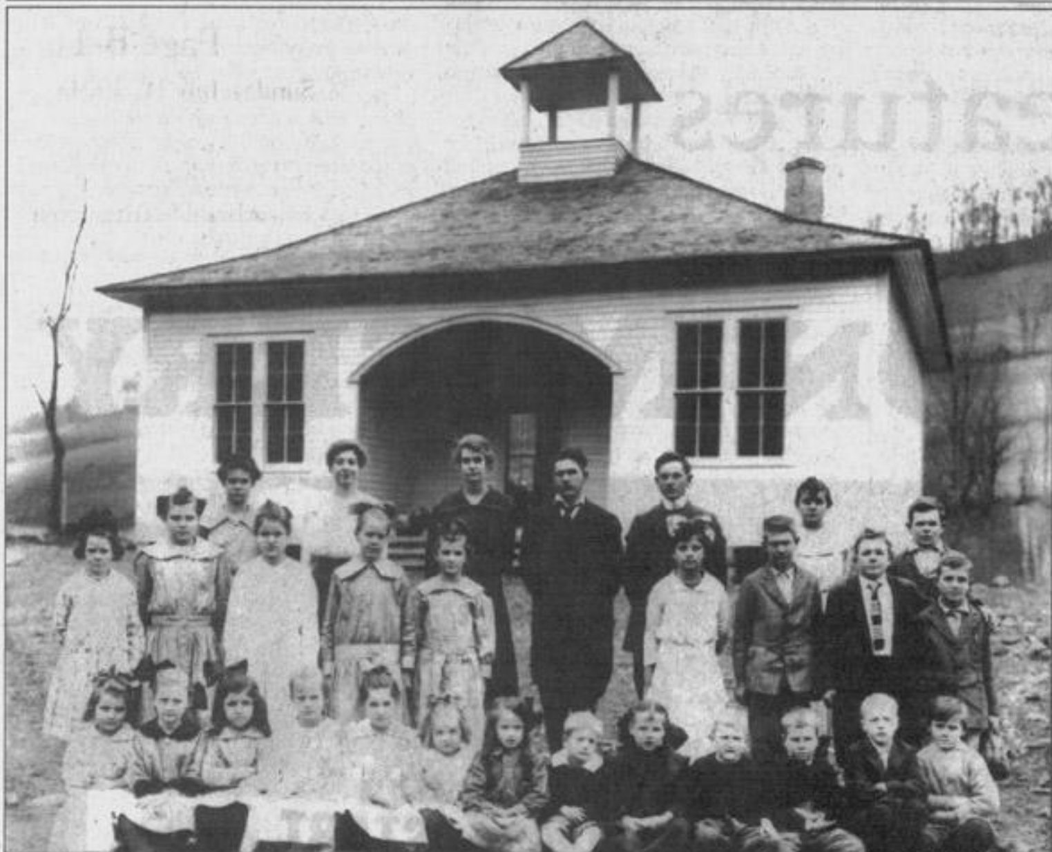
Jared School, 1917