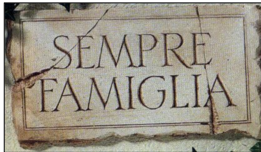
Family Forever Stone sculpture by artist Al Pisano;

“Man endures pain as an undeserved punishment; women accepts it as a natural heritage.” Anonymous