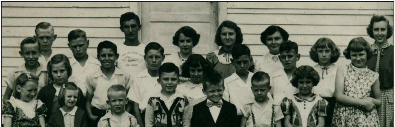
CHESTNUT MOUND SCHOOL

George H. Hewell & Son Funeral Home was in charge of arrangements.