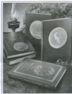
Sample Heritage Books