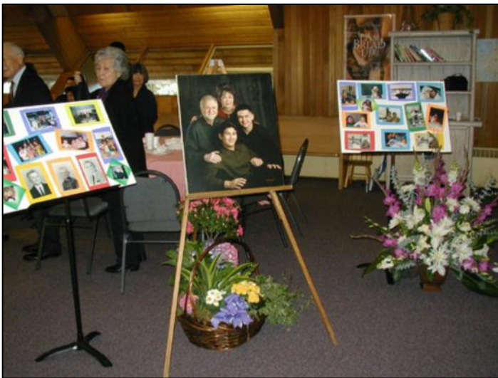
Collage pictures and flowers arranged for viewing at the memorial service tea. 27 th of December 2004 at the Church of Christ in Bellevue, WA.