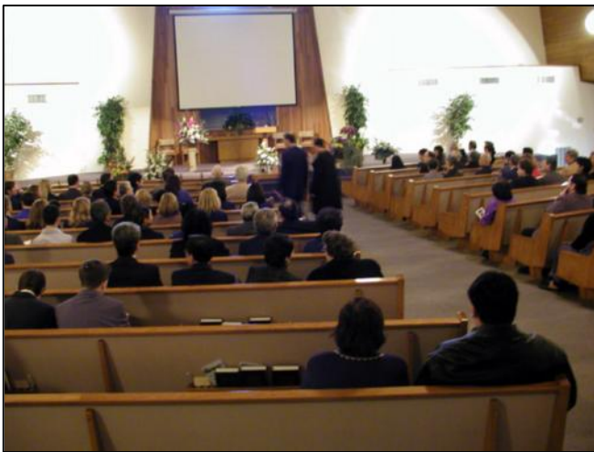
Church of Christ of Bellevue, WA