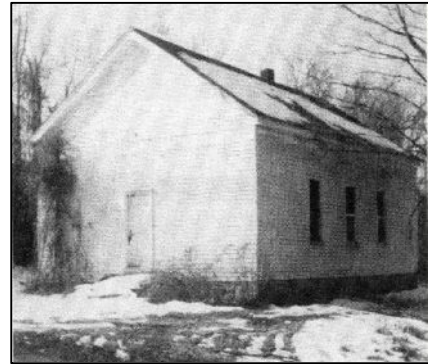
Denny's Seminary N36°08.427' W85°45.878'