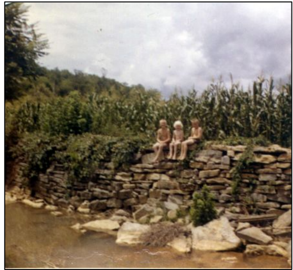
Stone wall by the bank of Little Indian Creek. Grapes used to grow on this stone wall. Corn is growing in the background.