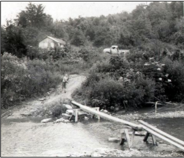
Little Indian Creek with the makeshift foot log. Storage building on top of the road once used to store the Model T car owned by Virgil Timothy Denny. Later the building was used to store the tractor for the farm.