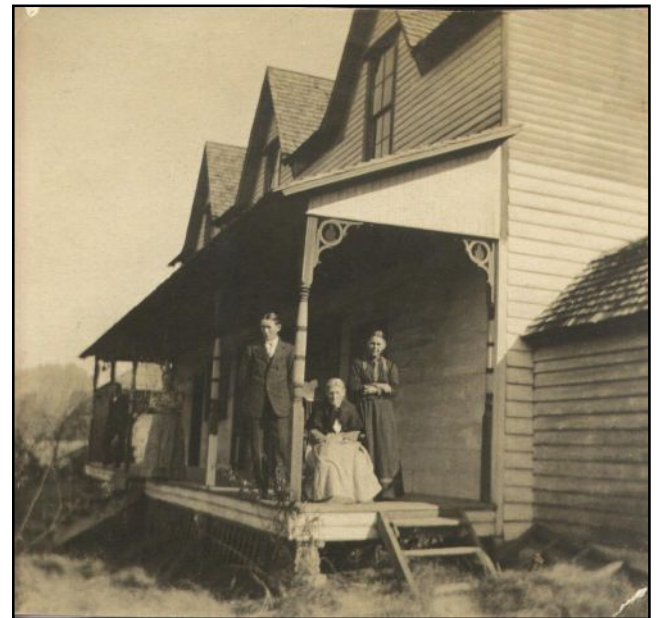
Timothy Denny's House. Located in the lower part of Putnam Co., TN, near Buffalo Valley on Big Indian Creek. Bullet holes riddle the old home from carpetbaggers shooting at it after the Civil War.