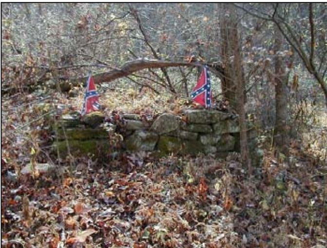
Confederate Soldiers Grave

Listed in Smith County Cemeteries - South of the Cumberland River Pg.186.