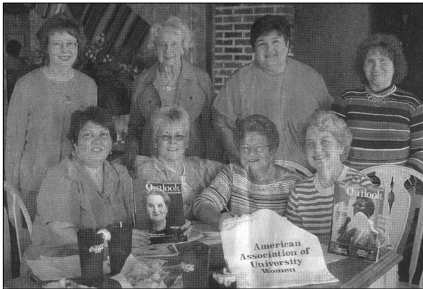
Cookeville AAUW Hosting State Convention Herald Citizen Newspaper, Cookeville, TN 20 April 2005