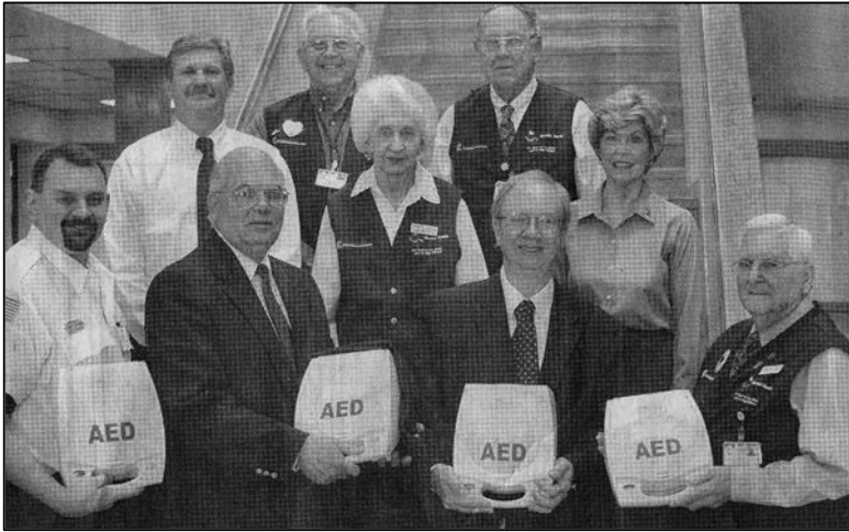
Herald-Citizen, Cookeville, TN Sunday, April 3, 2005 Page 3.