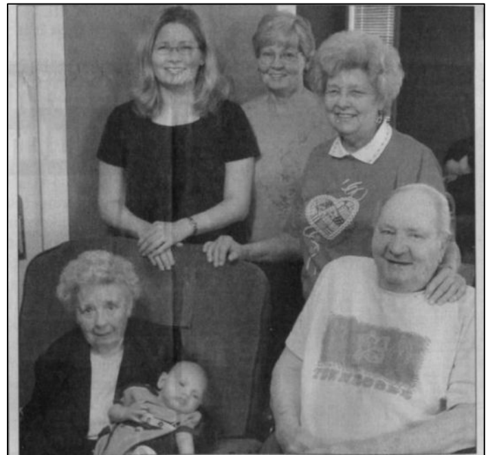
Family celebrates five generations of life